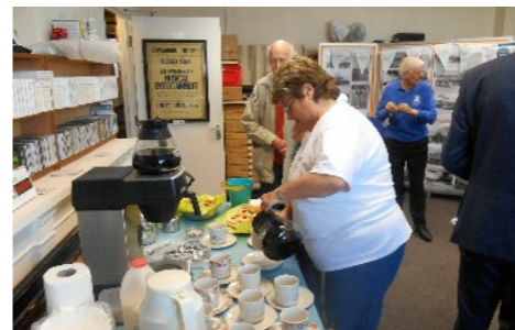
Coffee Morning at Bognor Regis Museum

Do you have any old photo's of the pier? Why not contact us with your memories of Bognor Regis Pier we would love to hear from you