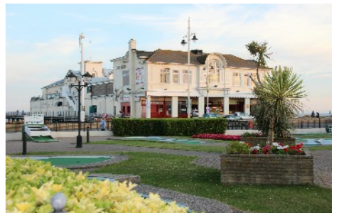
Summer evening view of Bognor Regis Pier