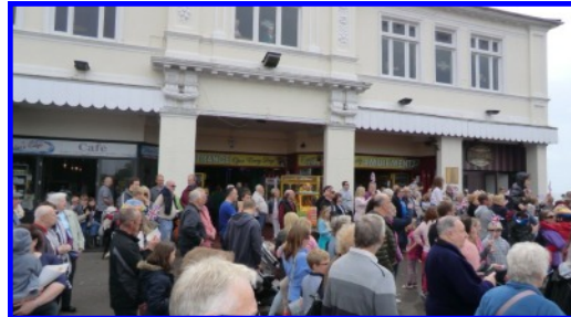
The crowd awaits the countdown to celebrate the exact opening time of the Pier at 2.00 pm.

The numbers attending the celebrations reflect the affection in which the Pier is regarded locally as a key asset for the town.