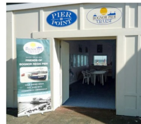
The Pier Point Visitor Centre

150 th Anniversary of the Opening of Bognor Regis Pier 04.05.15 What a success!