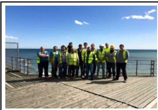
Team of Contractors