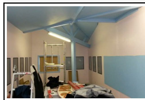
The pier point took 24 days from start to finish to refurbish